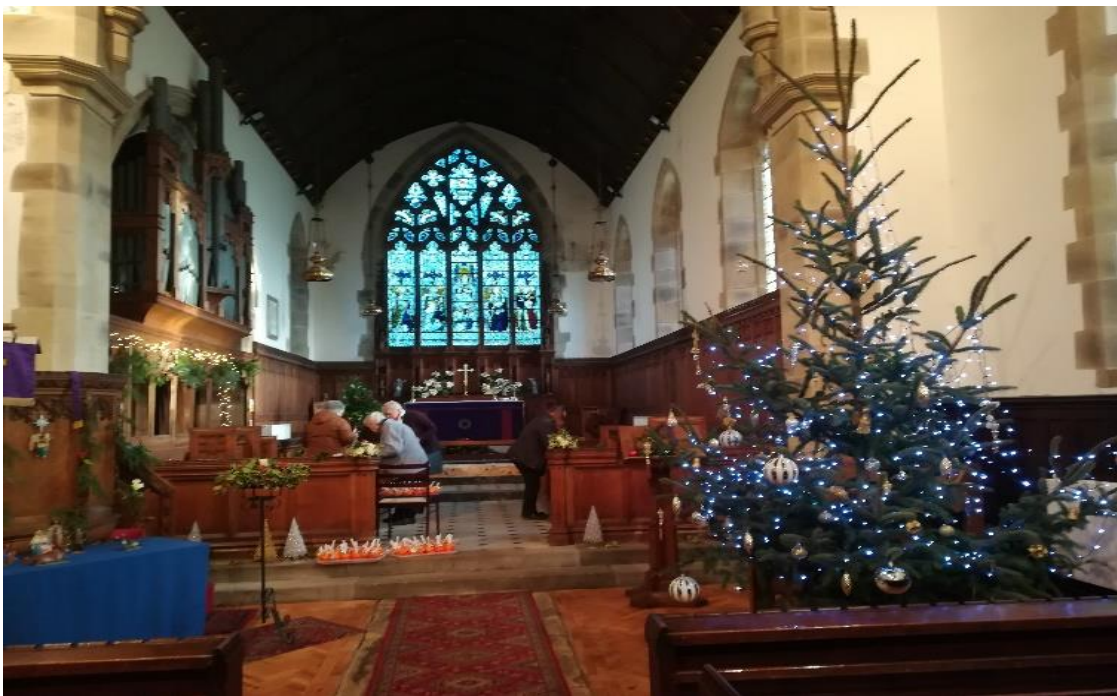
Preparing for the Christingle Service, December 2018

On Remembrance Sunday, the community turned out in force to remember the fallen at the War Memorial and they filled the church for the service that followed, with some of the village children reading out the names of the 21 soldiers who gave their lives during the first world war. We are also in the process of putting together a booklet about the lives and families of these 21 young men, copies of which will be available in church for all to read.