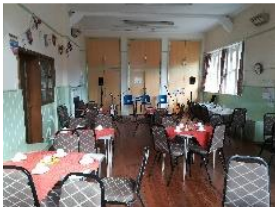
Greenhead Village Hall, set up ready for the Harvest Supper

There is an annual Duck Race on the Tipalt Burn, traditionally organised by the Village Hall Committee but there is a movement to make this more of a whole community event involving all elements of village life (school, church, pub, tea room etc).