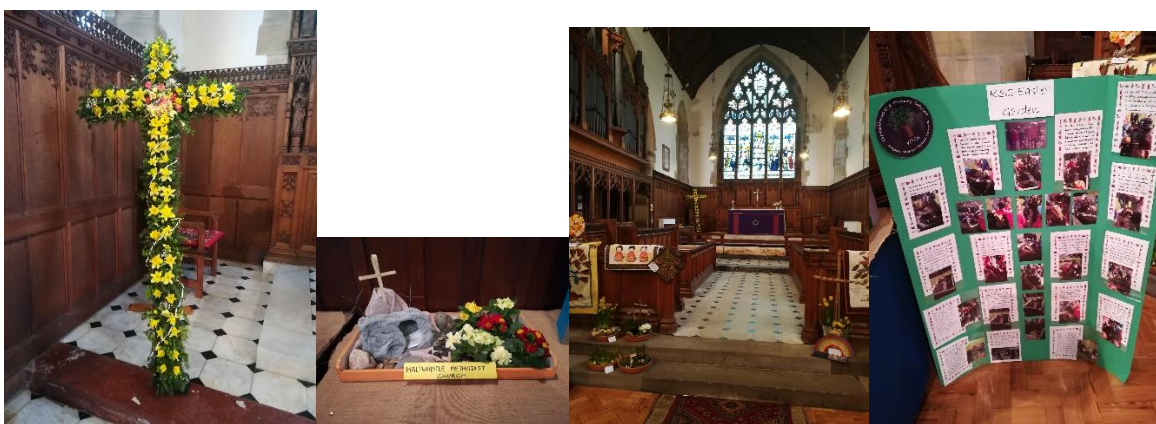
The Easter Gardens Exhibition in St Cuthbert's Church

The members of the regular church congregation and PCC are very keen to increase and strengthen the links with the community and in 2018 organised a number of events